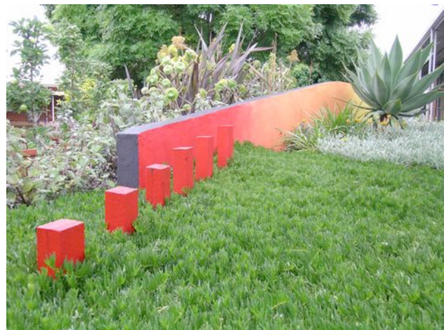
Textured rendered coloured wall