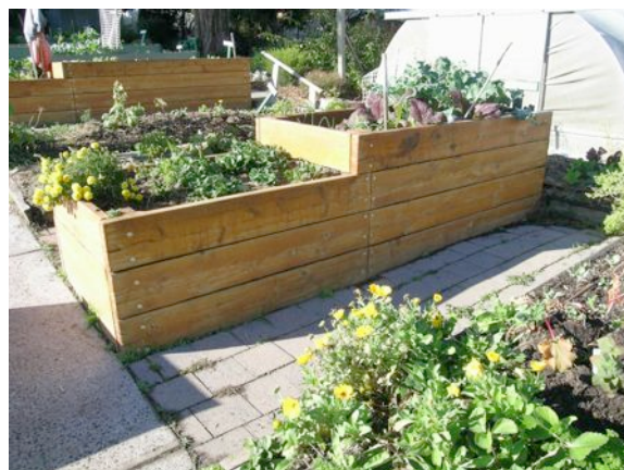
Raised bed with varying height

I would also suggest considering the possibility of keeping poultry, as this could provide great practical and therapeutic benefits. From managing green waste (food scraps and garden waste), to a source of eggs for the cooking program and also for the great opportunity for members to be involved in caring and nurturing for another living creature.