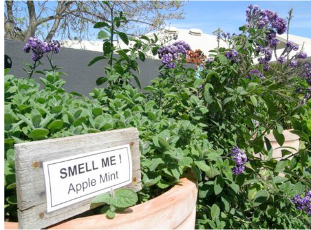
Herbs and plants for smelling