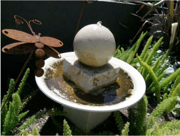
Water feature and art piece