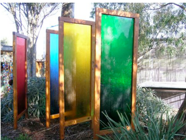
Coloured Perspex panels